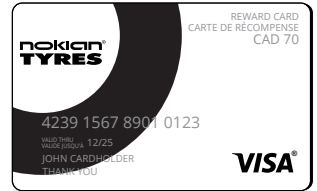
Illustration of the prepaid card as an example only. The received card can be different from that represented here.

✉ Email: nokiantyresupport@360incentives.com To check the status of your claim, visit: www.nokiantyresrebates.ca